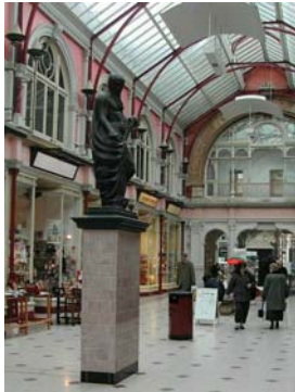
Royal Arcade, Boscombe