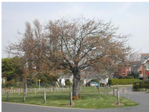
The Village of Wick