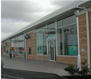
Castlepoint Shopping Centre