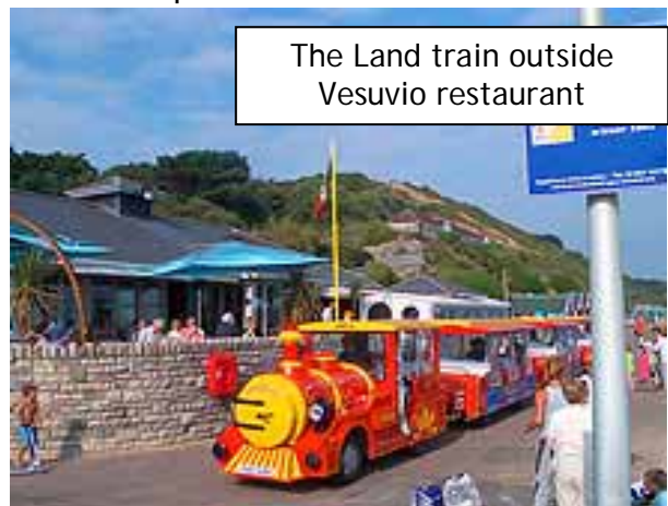
The Land train outside Vesuvio restaurant

Bournemouth Borough Council Parks Department, the Cooper Dean Estate, Argyll Bowling Club Trust, The Vesuvio Restaurant and the volunteer gardeners.