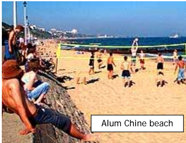
Alum Chine beach