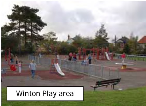
Winton Play area