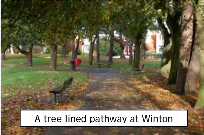
A tree lined pathway at Winton

All of Bournemouth Council's trees are looked after by the Arboricultural Section within the Parks Team. All trees are risk assessed with sites being zoned dependant on risk posed to people and property, with this increasing or decreasing on size, age, number, and condition of trees present. All information is held on GIS based Ezytreev tree management system.