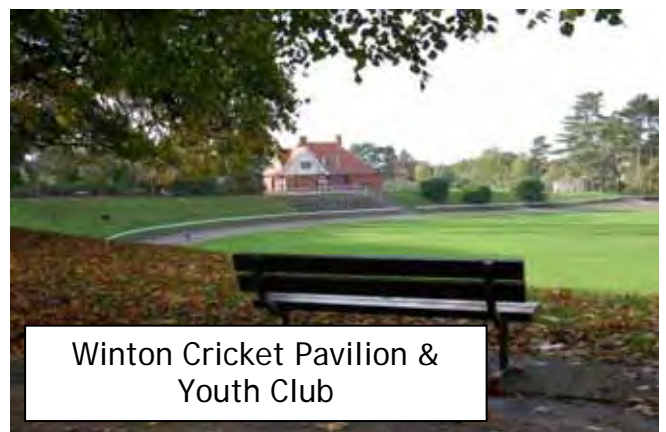
Winton Cricket Pavilion & Youth Club