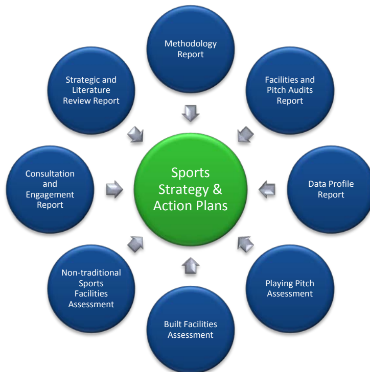
Figure 2: Suite of Documents supporting the Sports Strategy

Importantly, while the Sports Strategy was commissioned by Bournemouth Borough Council and Borough of Poole with support from Active Dorset and Sport England, it is not simply a strategy which focuses on the Councils' role and responsibilities, but is about the delivery and sustainability of sports provision as a whole, across Bournemouth and Poole, whoever the provider.