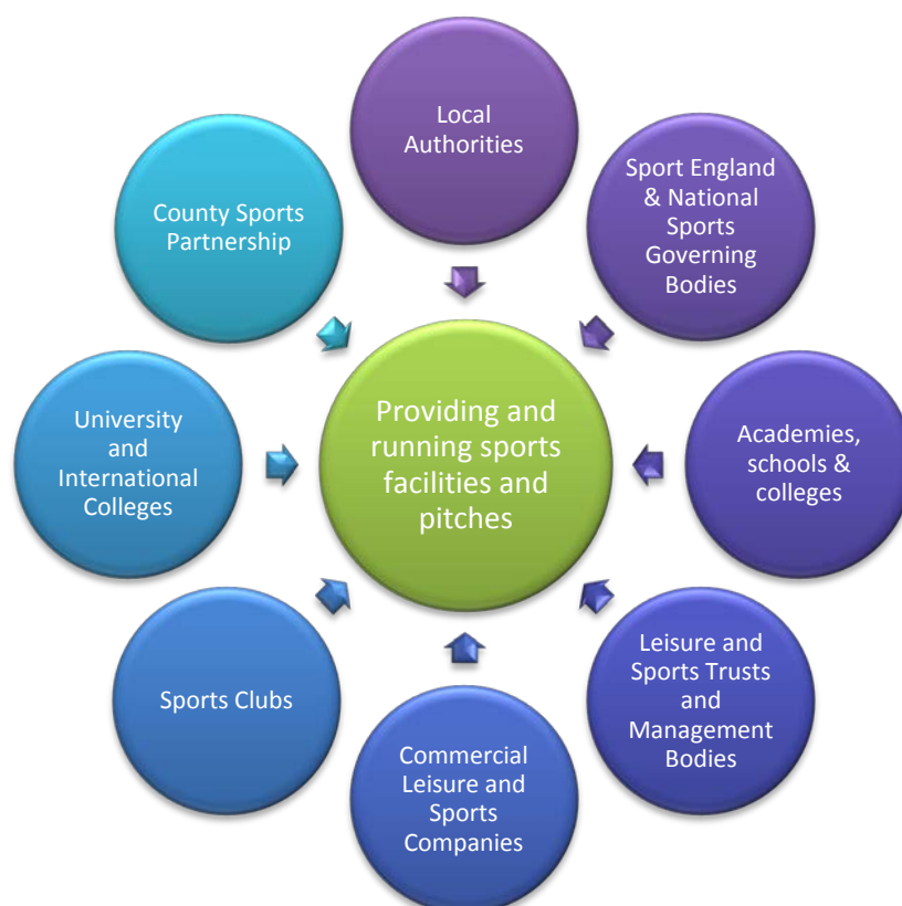
Figure 4: Partners likely to be involved in facility and pitch provision

As acknowledged above, the strategy has been produced at a time when there are significant delivery challenges and against a backdrop of changing roles and responsibilities. This strategy is not solely a local authority strategy and should be seen more as a strategy for Bournemouth and Poole, as places. The delivery, running and maintenance of high quality facilities and pitches will not only be the responsibility of the public sector and the local authority role is increasingly becoming one of enabling and supporting community aspirations for provision as an elected representative body, rather than supporting through direct funding. There are a number of key organisations which are likely to need to be involved in a partnership approach, the roles of which will depend on particular sports and facilities or pitches. Many of these are captured in the figure below.