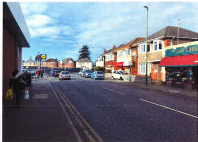
Withermore Road – location of previous “Buffalo”