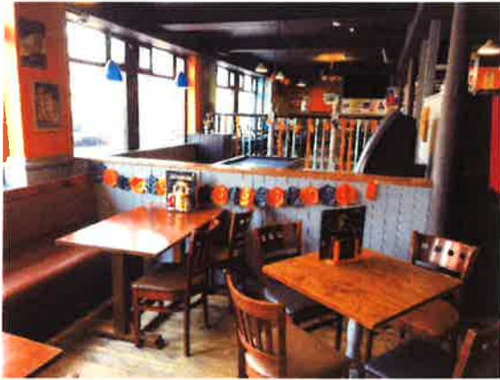
View from front door