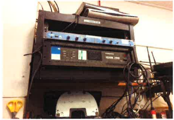
Sound system plug ins above stage and control boxes/amplifiers