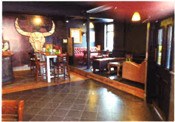
Front door on right and stage (raised area)