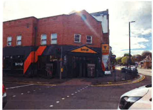
Premises from outside