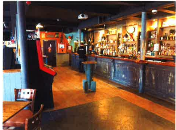
Views of the bar