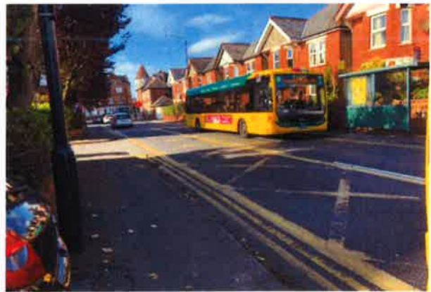
(Night) bus stop on Alma Road