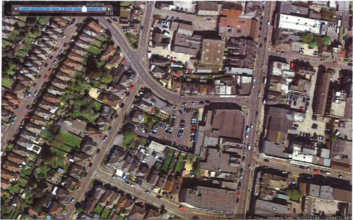
Original Buffalo site